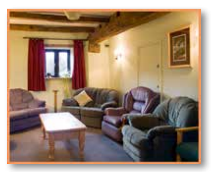
The Quiet Lounge